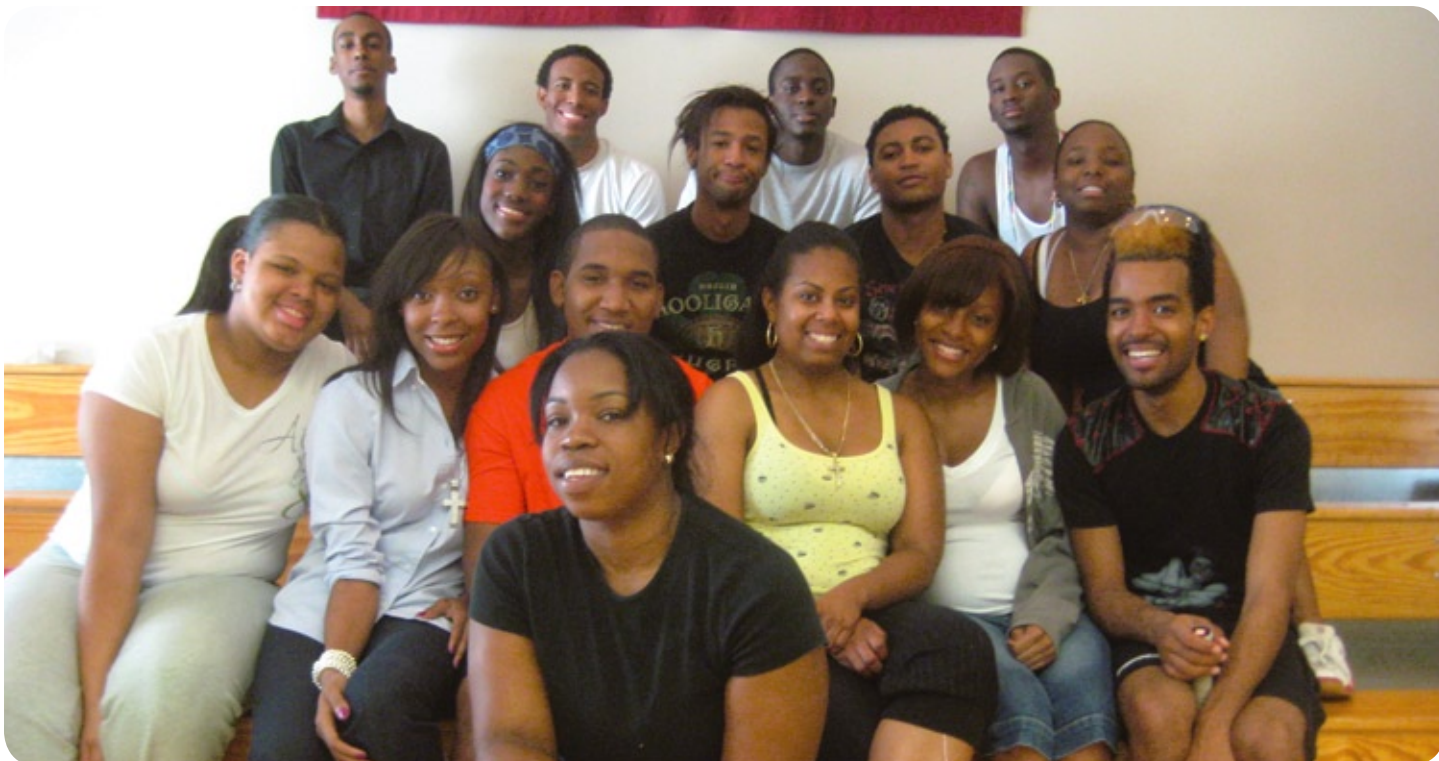
StreetSquash alumni gather for a day of squash and resume writing at the Harvard Club in August 2008.