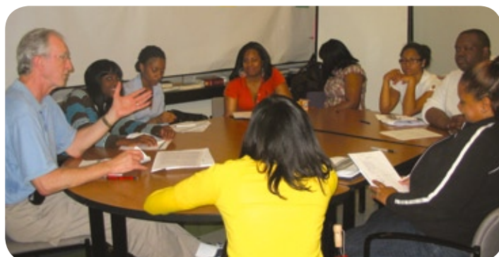
StreetSquash alums participate in the Get Hired Career Workshops.

The opportunities this program will offer our alumni are endless. We look forward to great success in the coming year.